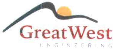
EXHIBIT B 2021 SCHEDULE OF BILLING RATES