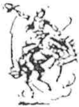
EXHIBIT "A" CITY OF MILES CITY PERSONNEL POLICY