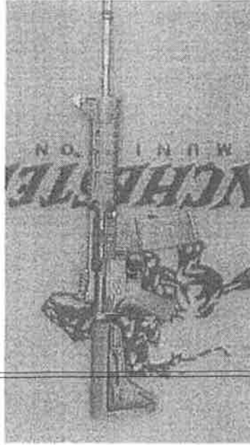
Colt M4 223 Caliber Rifle

Tickets are $25 each. Only 500 tickets will be sold. Tickets are available at Tubbs/Montana Bar, Miles City Police Department and the Dispatch Center. The drawing for this rifle will be held on February 27, 2018 at the City Council Meeting at 7:00 pm. Ticket holders do not need to be present to win. Funds raised from this raffle will be used to start up a K9 program to combat the increasing drug issues in the community.