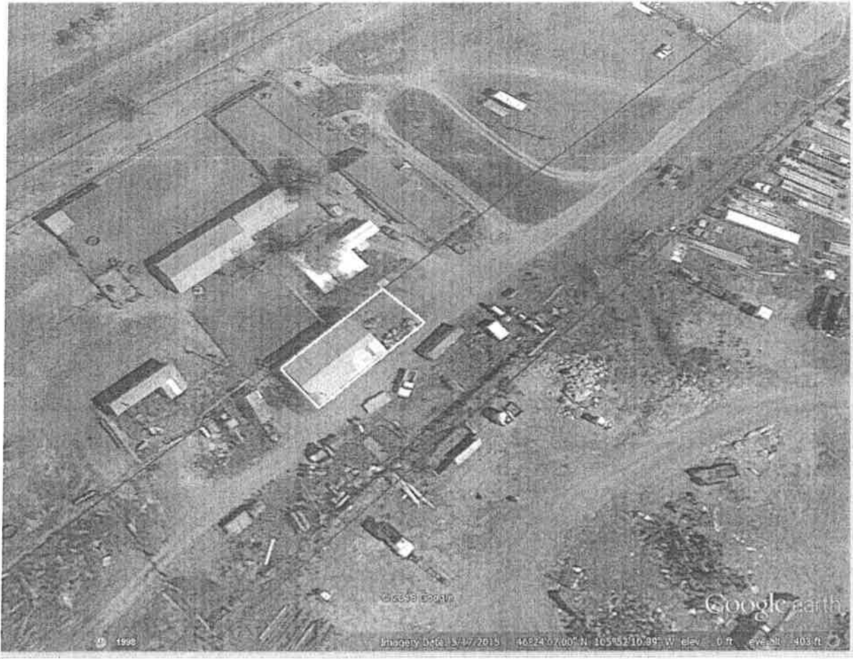
EXHIBIT A - LOCATION

*Outline is approximation of license area