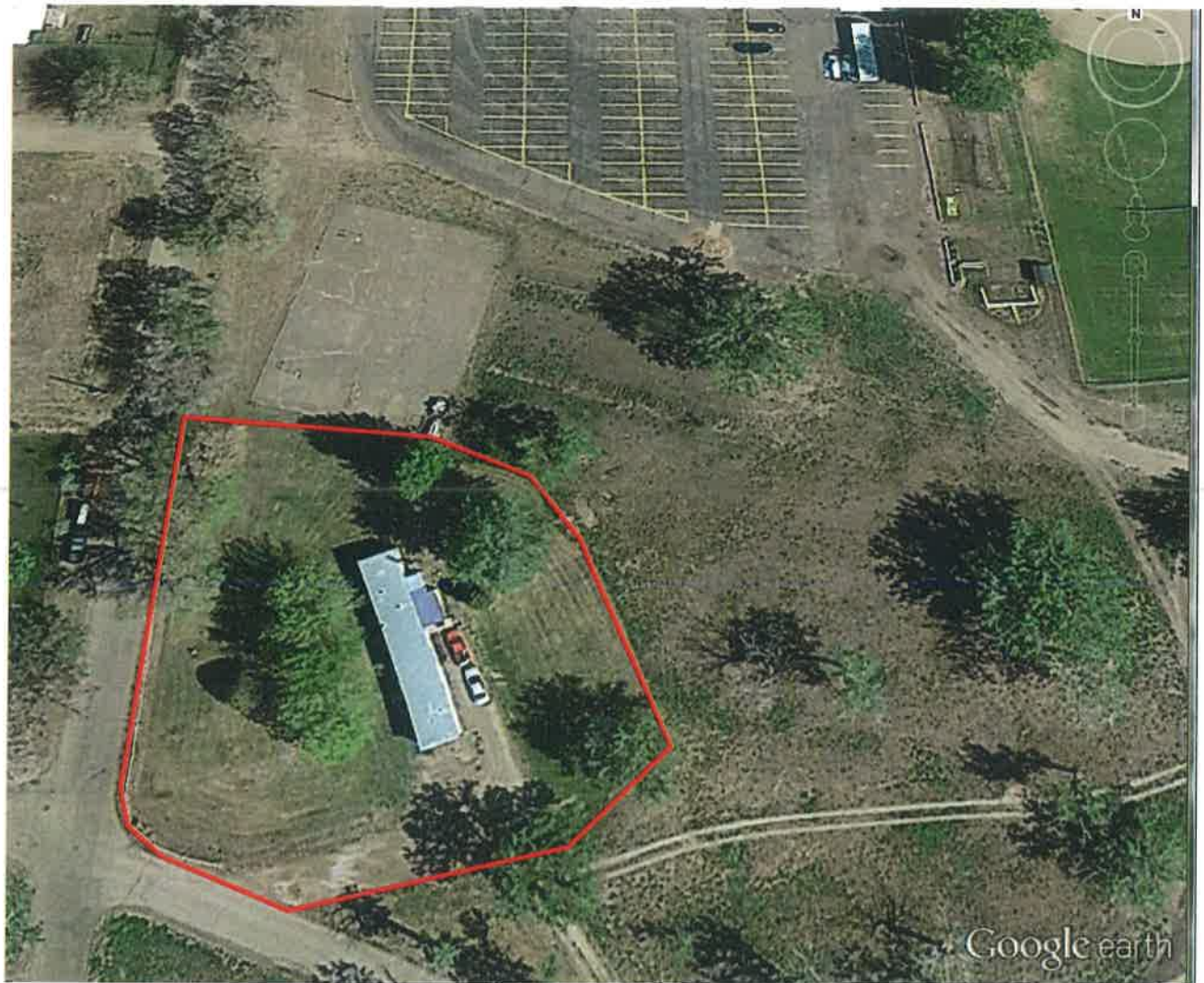
EXHIBIT "A" LEASED AREA